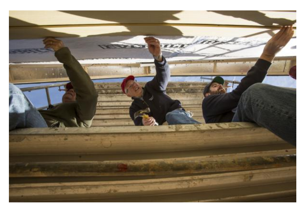
Habitat for Humanity, one of Rotary's newest service partners, builds homes for families in need, and provides opportunities for hands-on community service.