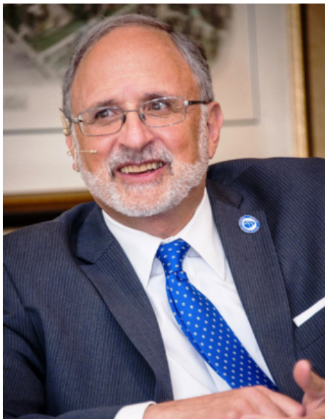
President, The World Affairs Council of Atlanta